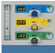
Total fresh gas flowmeter